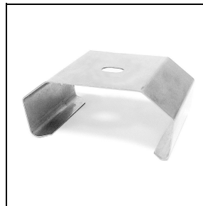
3100244 Stainless steel fast fit strong for quick ceiling mount (50 pieces)