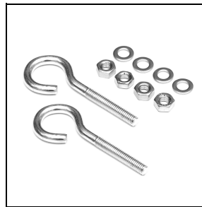
310550 Chain suspension