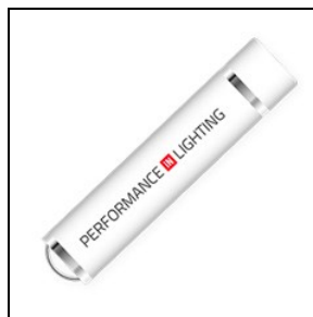
14469720 USB flash drive to use with PC for wireless programming