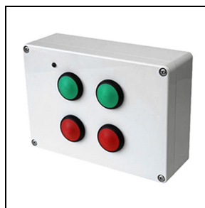
14477420 Wireless control pad with four configurable buttons

To maintain the regular updating of our products, PERFORMANCE iN LIGHTING reserves the right to make changes without prior notice. For the most up to date information we always recommend you read the latest version published on the website www.performanceinlighting.com . Delivered luminaire lumen outputs and power consumptions, including losses, are subject to a tolerance of +/- 7%, and unless otherwise stated the values apply to an ambient temperature of 25°C. Terms of warranty are available at https://www.performanceinlighting.com/qr/company/led-warranty