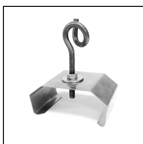
3100245 Stainless steel fast fit strong for quick ceiling mount + hooks (2 pieces)