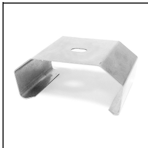
3100243 Stainless steel fast fit strong for quick ceiling mount (2 pieces)