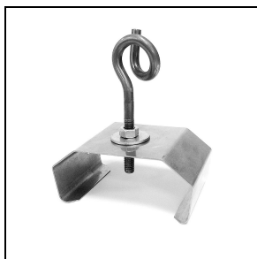
3100245 Stainless steel fast fit strong for quick ceiling mount+ hooks (2 pieces)