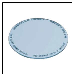
8435965 Food glass filter for fish products