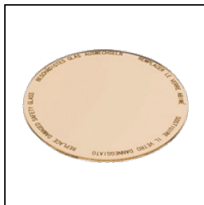
8435962 Food glass filter for bakery products