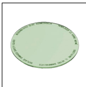
8435964 Food glass filter for vegetables