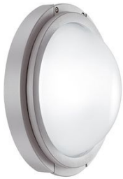
Glass Lens (standard)