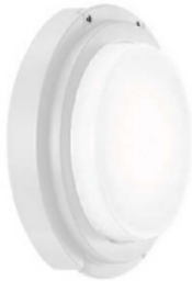
Flat Polycarb Lens 26W only