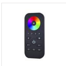
310429 RGBW hand held remote