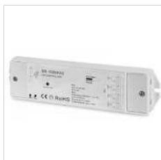
3104173 RGBW RF controller 4 channel (0.35A each CH)