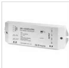
3104163 RGBW WIFI controller 4 channel (0.35A each CH)