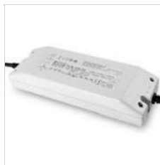
17096 Kit driver 48V WP