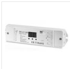
178973 RGBW DMX enabler/decoder 4 channel (0.35A each CH)