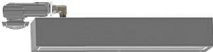
OCC HI/LO Sensor

80 CRI STANDARD - OTHER OPTIONS AVAILABLE