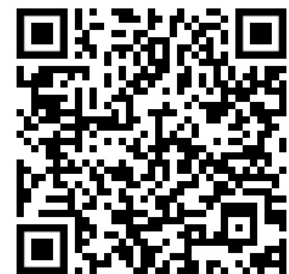
KHA CITY COMFORT 24