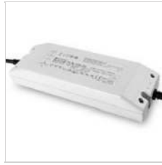
17096 Kit driver 48V WP