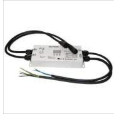
31041730 RGBW RF controller WP 4 channel (0.35A each CH)