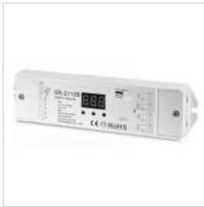
178973 RGBW DMX enabler/decoder 4 channel (0.35A each CH)