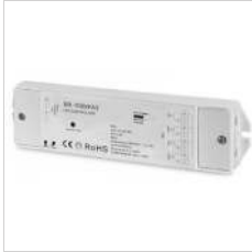
3104173 RGBW RF controller 4 channel (0.35A each CH)