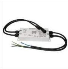
1789730 RGBW DMX enabler/decoder WP 4 channel (0.35A each CH)