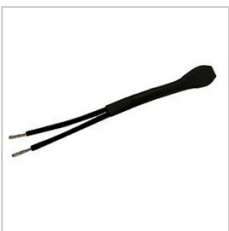
11015 Terminating Resistor