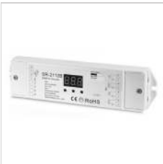
178973 RGBW DMX enabler/decoder 4 channel (0.35A each CH)