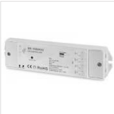
3104173 RGBW RF controller 4 channel (0.35A each CH)