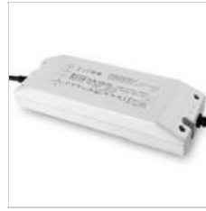
17096 Kit driver 48V WP