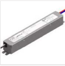
17433 Kit driver 48V