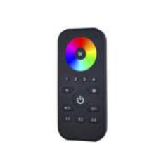
310429 RGBW hand held remote