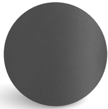
AN-96/ IRON GRAY/ Textured