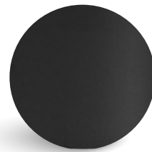
BK-40/ ANODIZED BLACK/ Matt