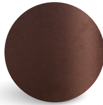
RB-10/ IRON RUST/ Textured