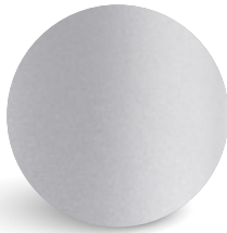
GR-94/ ALUMINUM METALLIC/ Textured