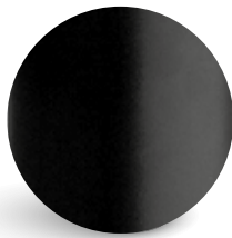
BK-81/ TEXTURED BLACK/ Textured