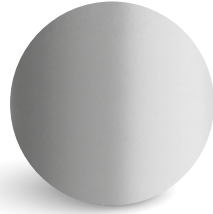
INOX10/ STAINLESS STEEL/ Glossy