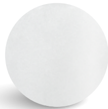
WH-87/ TEXTURED WHITE/ Textured